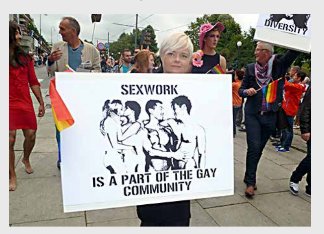
Sex worker activism at Oslo Pride, Norway

"We have succeeded in the way we have manage to get national LGBT-organization to establish a resolution against the ban on purchasing sex and our engagement in Oslo Pride. Our perspective have many supporters who also participates in public debates but... our threshold is the governmental level"